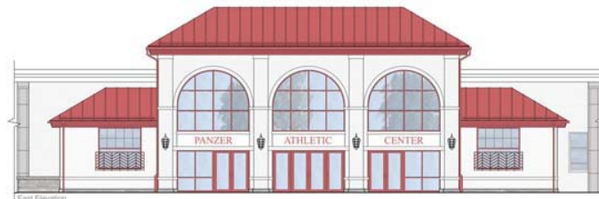
Montclair State University - Panzer Athletic Center January, 2008

Reopened in fall 2009 following extensive renovation, Panzer Gymnasium (approximately 70,000 gross square feet) received upgrades to the competition gym, a new building entrance (façade) on College Avenue, interior upgrades, a new electrical system, and extensive upgrades to the present HVAC system.